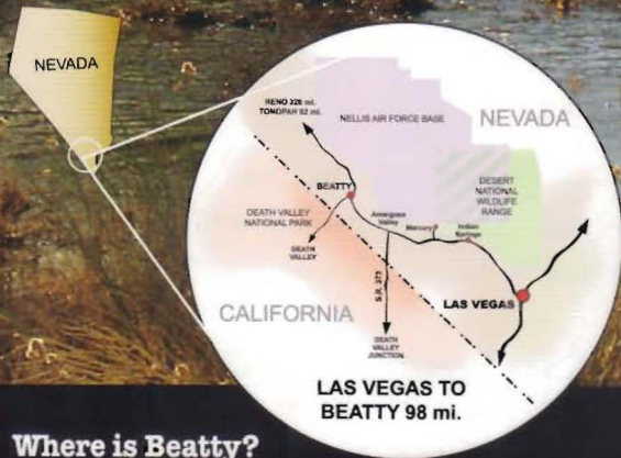
Where is Beatty?

A true oasis from the harsh environments of the Mojave and Great Basin Deserts — the trees, wetlands and open spaces along the Amargosa River also give habitat to year-round resident birds and nesting seasonal birds, regularly supporting 21 species that have been identified as NV Partners in Flight conservation priorities. Waterfowl, raptors, landbirds, shorebirds — recent surveys have recorded some 100 species of neotropical migrants that make use of this area, during spring or fall migration. The area also hosts a significant number of single-species concentrations, with more than 25,000 individuals from four groups of the wood warbler family passing through in spring.