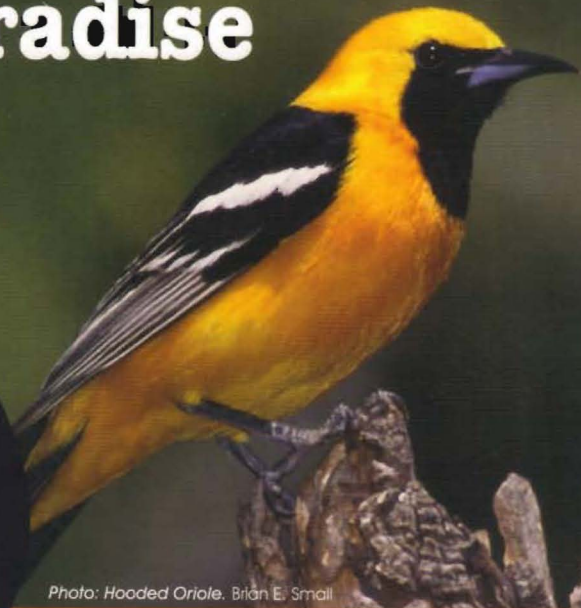
Hooded Oriole.

Here in the Beatty-Oasis Valley of Southwest Nevada, just a few miles east of Death Valley, birders — whether celebrating a grand passion or indulging in a casual pastime — are discovering the desert paradise that is the Amargosa River. Recently recognized as an Important Bird Area (IBA) by the National Audubon Society, the Amargosa River area provides a rare and essential habitat — namely, desert riparian — for an exceptional diversity of migratory and resident birds.